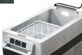
REMOVABLE BASKET INTERIOR NIGHTLIGHT