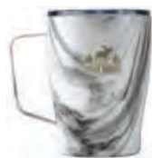
DWCBHW17 Harbour White