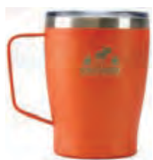
DWCBB017 Blaze Orange