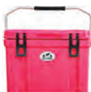
CRCR25 Canoe Red