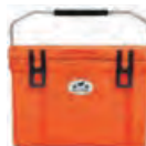
CRBO25 Blaze Orange