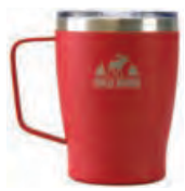
DWCBCR17 Canoe Red