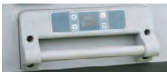
LCD DISPLAY RUGGED HANDLES