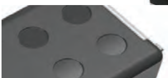
LID RECESSES FOR CAMPSITE DRINKS